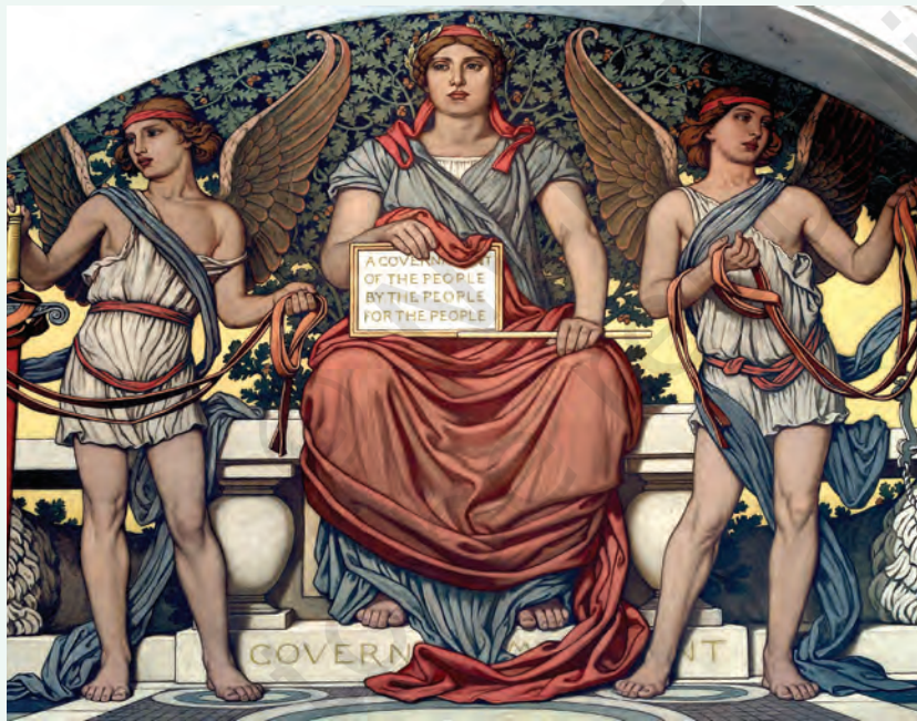
Fig. 9.4. An 1896 mural by the painter Vedder called ‘Government’ from the Library of Congress, USA.

Abraham Lincoln, a U.S. president in the late 19th century, described democracy as a ‘government of the people, by the people, for the people’, a phrase still widely used today.