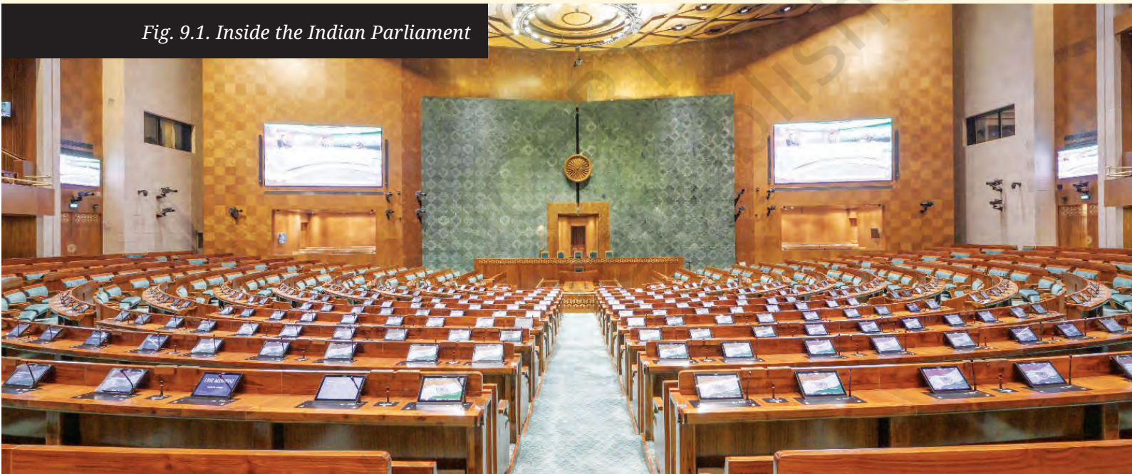
Fig. 9.1. Inside the Indian Parliament

Kauṭilya in Arthaśhāstra (translation by L.N. Rangarajan)