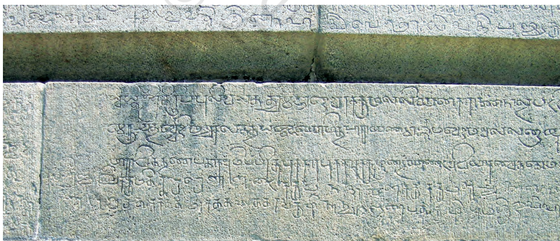
Fig. 9.6. Chola period inscriptions on the walls of Vaikuntha Perumal temple, Uttaramerur, Tamil Nadu

Indeed, the voice of the common people has been valued and upheld in India through the ages, even when the power was in the hands of a king or queen. A remarkable example from the Chola period is seen in the Uttaramerur inscriptions from the 10th century CE in Tamil Nadu, which provide us with details about the election of members to the village sabhā (local administrative body). We learn about the election process, including sealed ballot boxes, qualifications of members, their duties, and also the conditions that could lead to their dismissal.