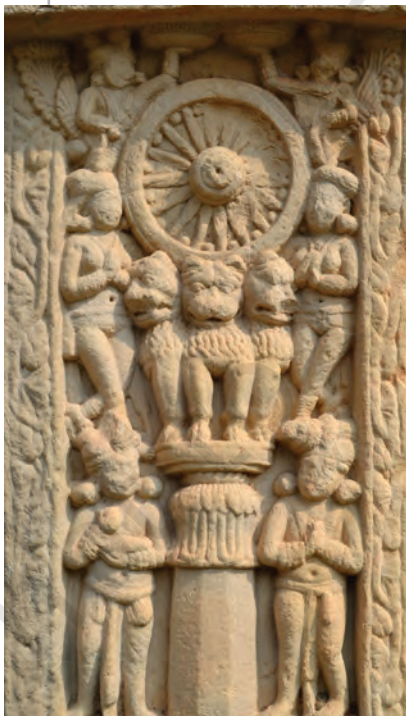
Fig. 9.7. Adoration of the pillar of Sanchi Stūpa

However, in many parts of India, the power of the raja was neither absolute nor beyond question. The king was