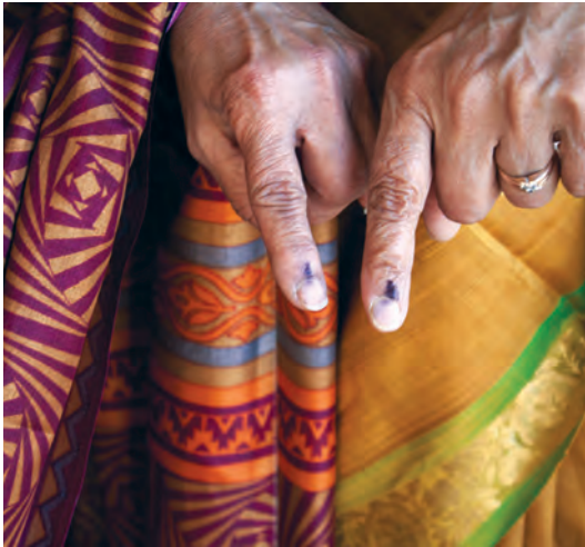
Fig. 9.5. Voting in India

Most of the democracies today are representative democracies. But every democracy functions differently. Here are the two forms of representative democracy.