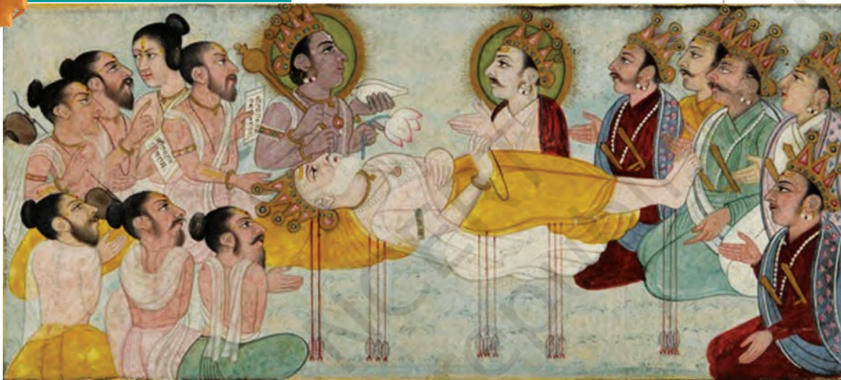
Fig. 9.8. A 17th-century Rajput miniature painting depicting Bhīṣma lying on a bed of arrows, teaching Yudhiṣṭhira while Kṛiṣṇa sits at the head, witnessing the moment.

In the Shānti Parva of the Mahābhārata, when Bhīṣma, the wise elder of the Kuru dynasty, lies on a bed of arrows awaiting his death, he teaches Yudhiṣṭhira, the eldest Pāṇḍava, at great length on good governance, justice, and the moral responsibilities of a raja. A raja is not just a ruler; the welfare of his people is his highest priority. He must apply the law without bias to ensure fairness and equality. He must not get attached to power, as it fosters ego and corruption. He must seek guidance from wise advisors to ensure just and well-informed decisions. The raja must understand that his authority is temporary and bound by dharma.