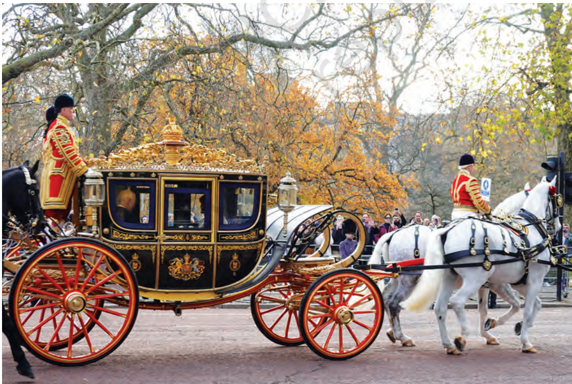
Fig. 9.9. King Charles III in a ceremonial coach during the visit of a foreign dignitary.

This means that all the laws are made by the elected parliament, and executive power is exercised by the Council of Ministers led by the prime minister. So while Britain has a king, it really is, today, a parliamentary democracy. This kind of monarchy is called a constitutional monarchy.