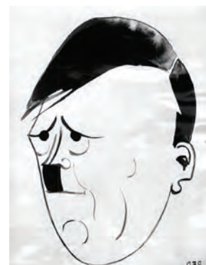
Fig. 9.10. Caricature of Adolf Hitler